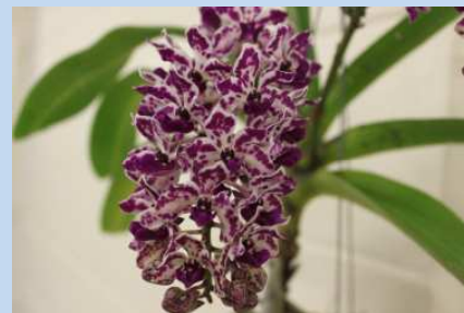
Registrar's Choice – Species: Rhy. gigantea gained 80 Points for W&C Sewell.